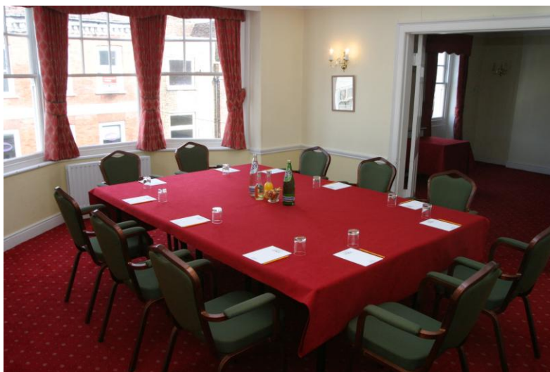
The Abbot Suite