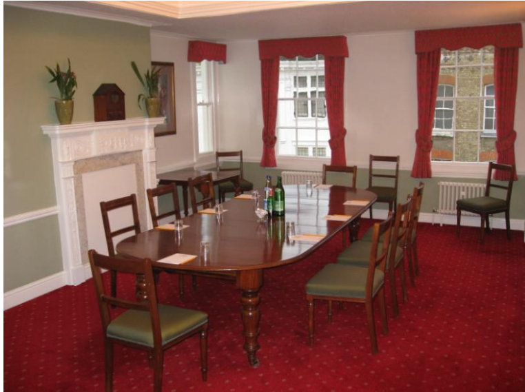
The Carroll Suite