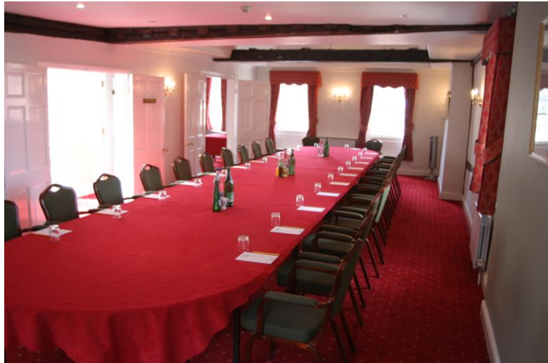
The Wodehouse Suite